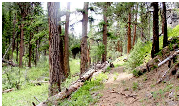
At some spots along the trail, old growth larch form pure stands.