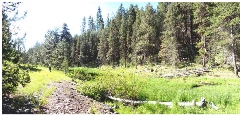
The trail starts out on an abandoned roadway, bulldozed over the historic wagon road.