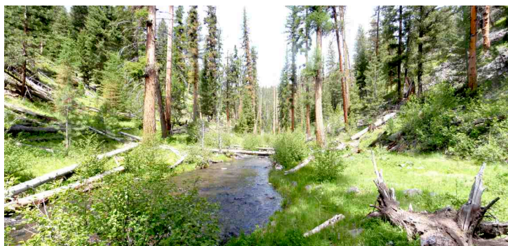
A great spot for a destination picnic and rest on the banks of Crane Creek.