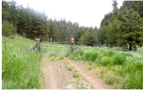
The trailhead is found off Road 1663, where Crane Creek leaves Crane Prairie.