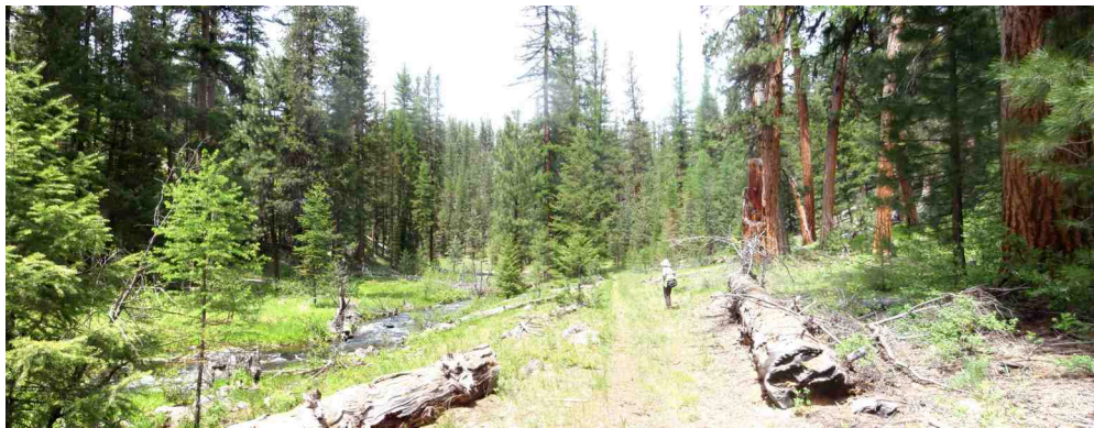
Further downstream, old growth ponderosa groves are found along the wagon road.