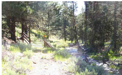
After one mile, the trail follows the original wagon road downstream through this gate.