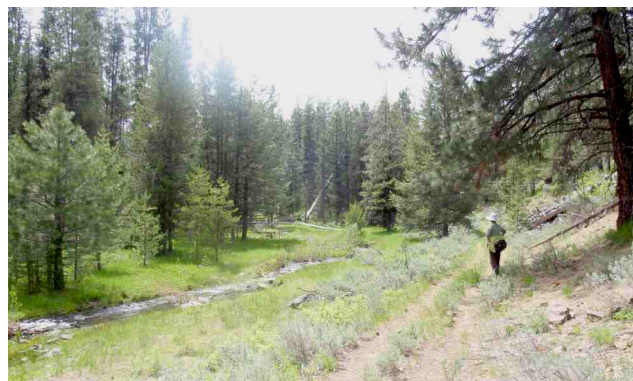
The streamside forests on the upper creek are a mix of lodgepole pine and larch.