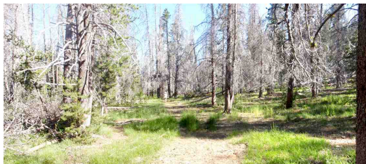
The trail goes about a mile through stands of beetle-killed lodgepole pine...