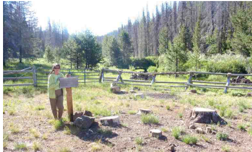
The hike begins at the Sycan Trailhead Forest Camp, on the Upper Sycan River.