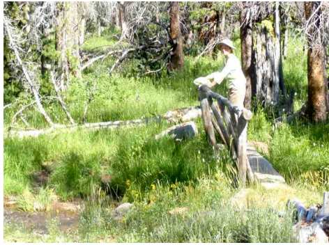
The trail is well-built, with log and rock footbridges over the side streams and seeps.