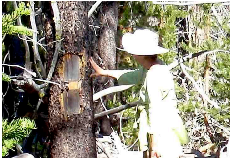
Marking the trail throughout its length are double rectangular tree blazes.