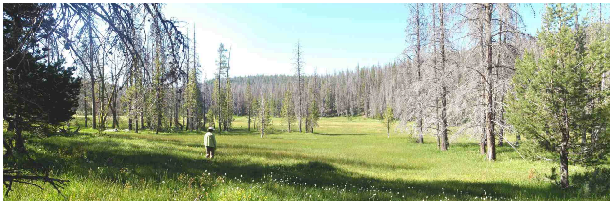
...before reaching the first of the large wet meadows along the Upper Sycan River.