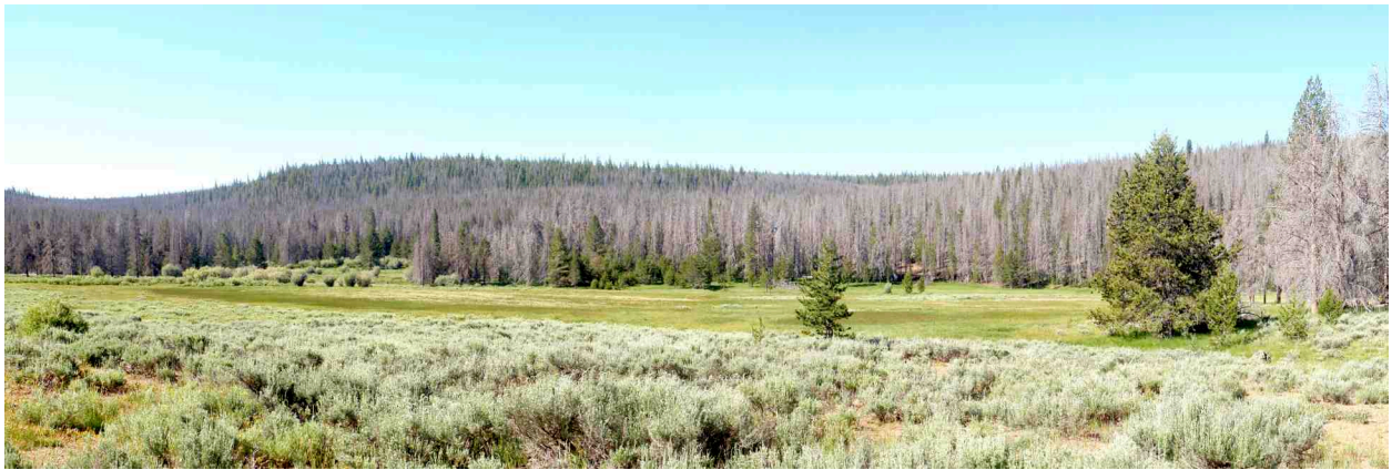
The long wet meadows (with abundant wildflowers in spring) are the main attractions along the trail.