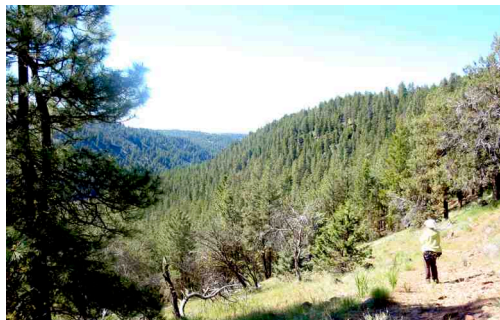
The well-built trail switchbacks for 1.5 miles down to the river below.