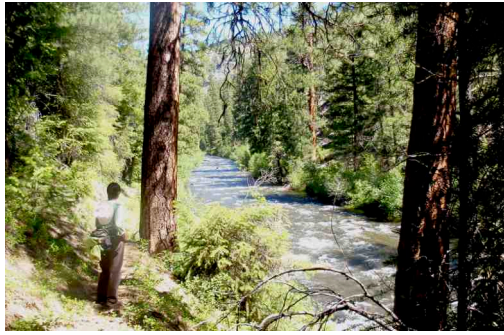
The trail meets the river in a mature forest of ponderosa pine and Douglas fir.