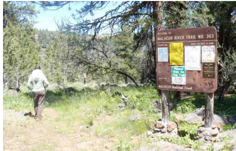
The trailhead is on a forested knoll, at the east edge of Hog Flat.