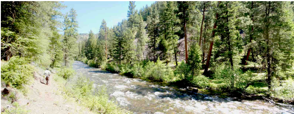
The trail follows the west bank of the river upstream, through broad flat river terraces....