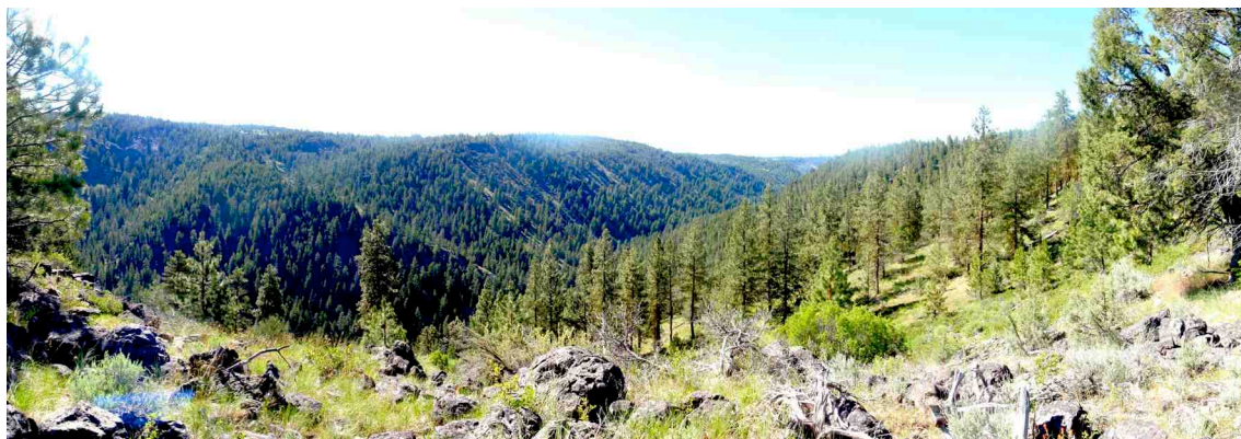
From the trailhead, there is a sweeping view to the south, down the Malheur River canyon.