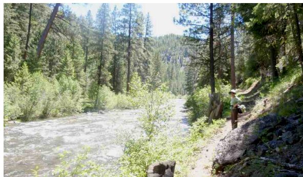
...which alternate with narrow steep river banks.