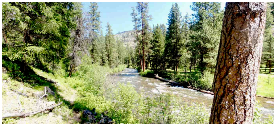
A good lunch destination is a shady riverside terrace with old growth ponderosa pines.