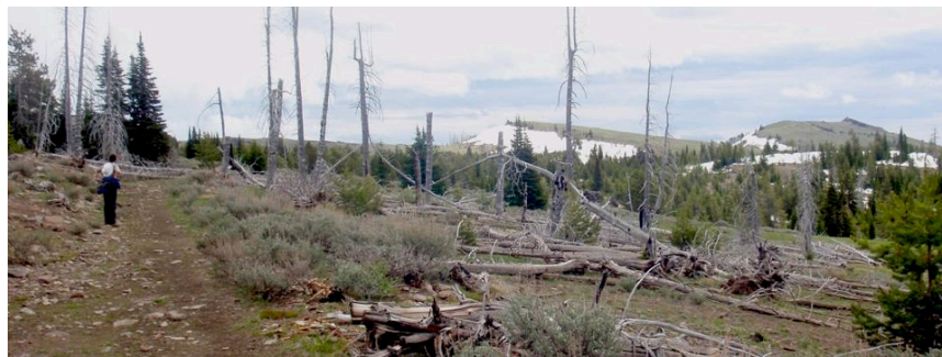
Approaching the ridge crest, with the first views of Monument Rock in far distance.