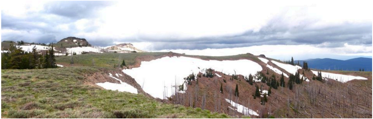
View northwest toward Table Rock, along the head of old glacial cirques at right.