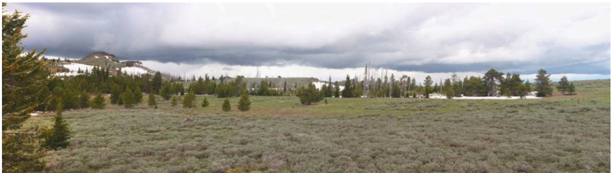
Hiking along the ridge crest is easy, either along old roads or cross-country in most any direction.