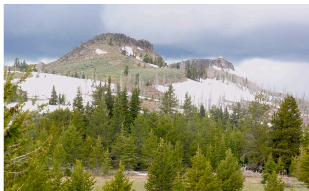
At ridge crest, looking northwest to Table Rock and fire lookout on right.