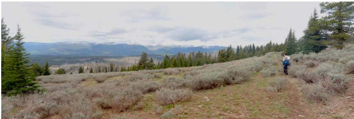
Looking back down the trail, to the west, with sweeping views of Glacier Mountain.