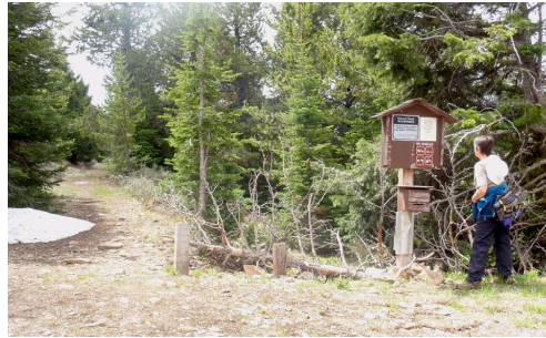
The trailhead is on a switchback in the road, about 0.8 miles below the fire lookout.