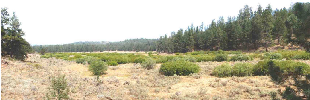
...and innumerable smaller “stringer meadows” along most streams and seeps.