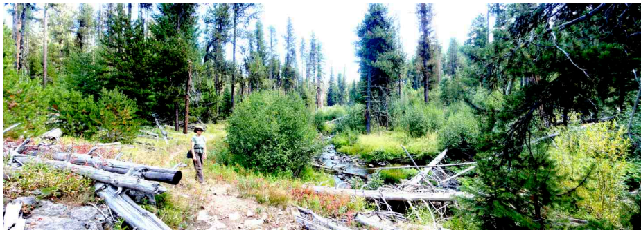
...and the well-developed trail down into the Rock Creek canyon.