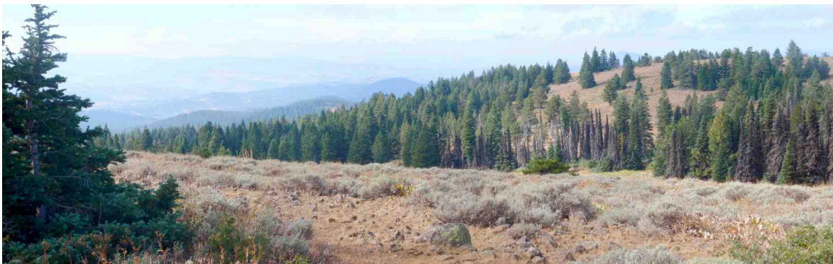
...and the long sweeping views are worth the walk to the mountain top.