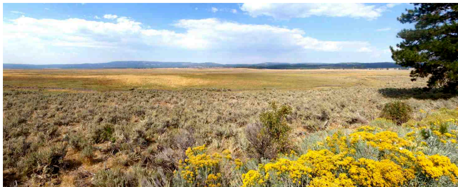
Found here also are grass prairies, both immense meadows like Big Summit Prairie...