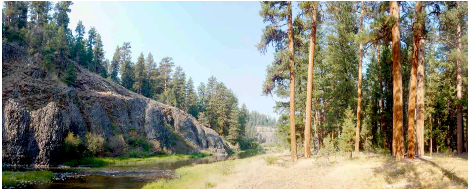
For the day hiker, less-visited destinations include the North Fork Crooked River...