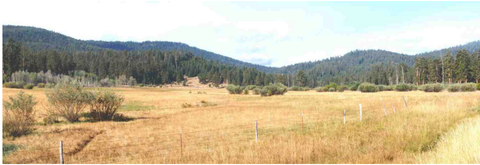
The western half of the Ochoco Forest has more rainfall, thicker forests—and many more visitors.