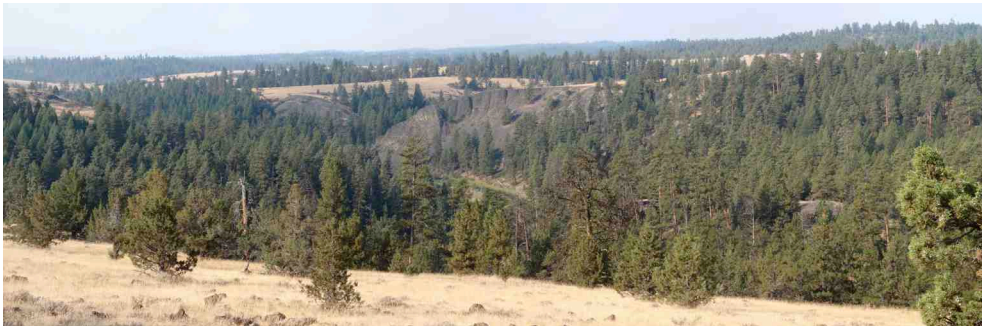
The eastern forests are mainly in the canyons, with grass and sage flats on the drier, rolling uplands.