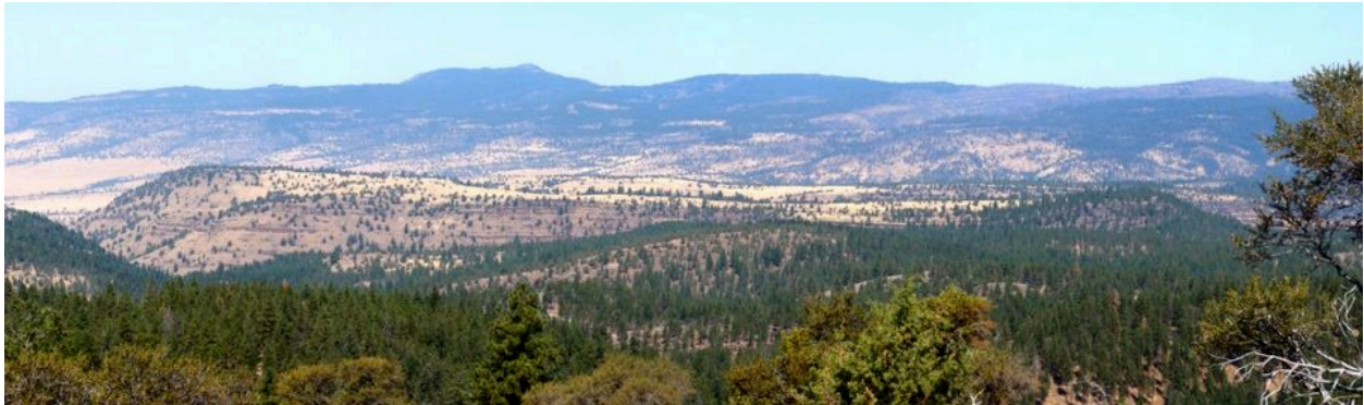
Shake Table is an long, flat-topped basalt "island," which stands between two forks of Murderers Creek.