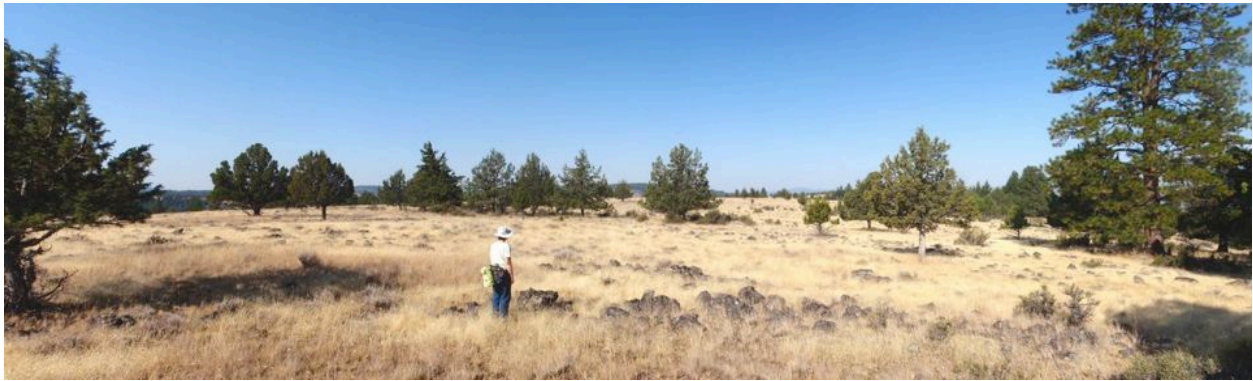
Once on top, the horse trail forks into many branches, so it's best to just strike out cross country.