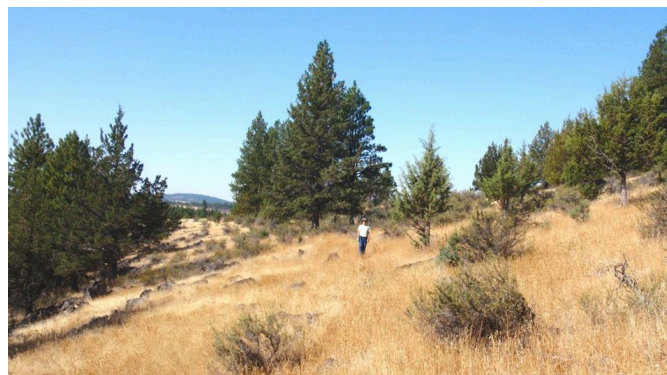
Approaching the top of Shake Table, the well-worn wild horse trail traverses a long flat bench.