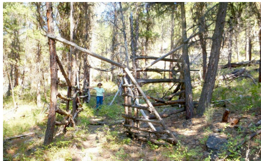
About halfway to the top, the trail passes directly through an old wild horse trap, made of pine poles.