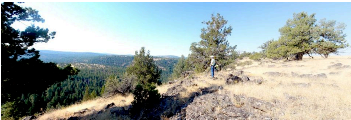
To the south, there are sweeping views across the South Fork Murderers Creek watershed.