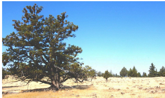
Several old, picturesque juniper trees are found on Shake Table.