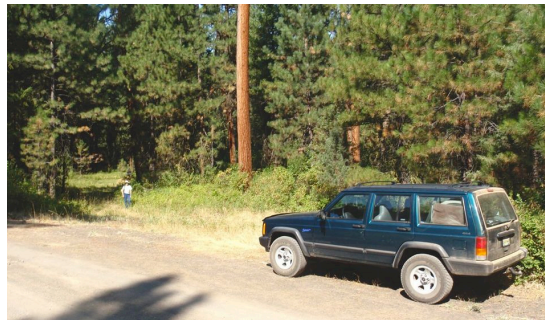
The trail starts at a pullout on Road 2490 and follows a side road down into South Fork Murderers Creek.