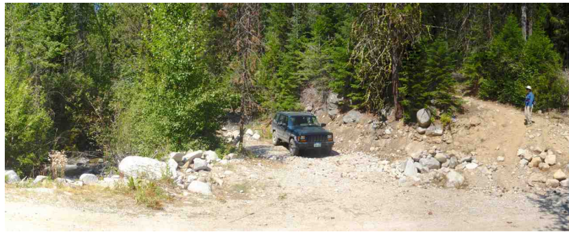
The unsigned trail starts at a pullout on Road 5520, just before the road crosses Killamacue Creek.