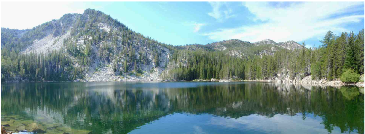
Scenic Killamacue Lake, set below the Chloride Ridge, is a wonderful reward for the 2,000' climb.