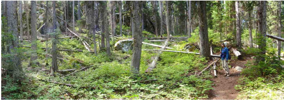
The trail then climbs along benches above the steep gorge, through old uncut stands of larch and fir.