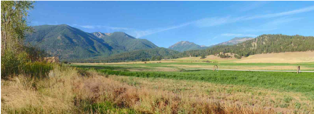
The Killamacue Basin (right center) and Rock Creek canyon (center), seen from the east Elkhorn foothills.