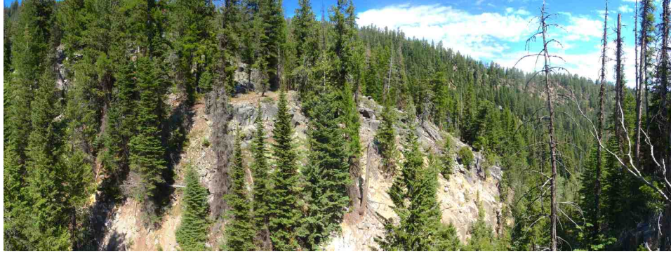
Within the first 2 miles, the trail has to climb above the steep granite gorge of Killamacue Creek.