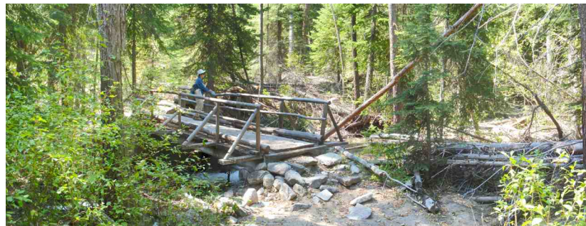
At 0.6 miles, the trail crosses the first of three footbridges, found at each crossing of Killamacue Creek.