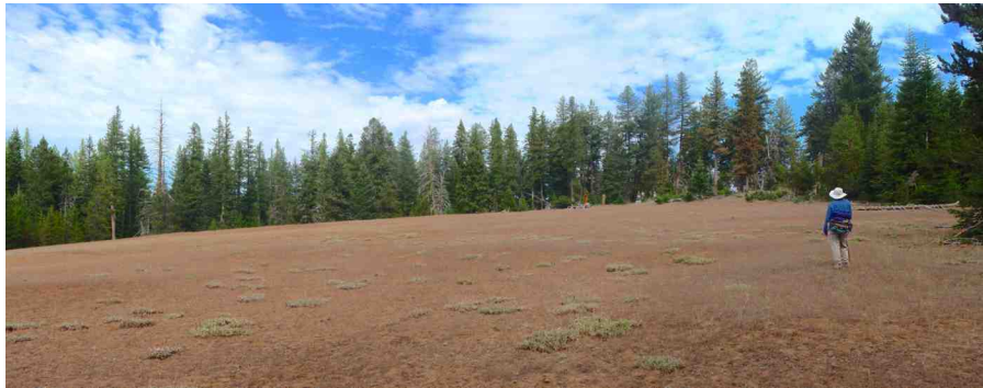
...and open "balds" where sparse bunchgrass, wildflowers and forbs are the only ground cover.