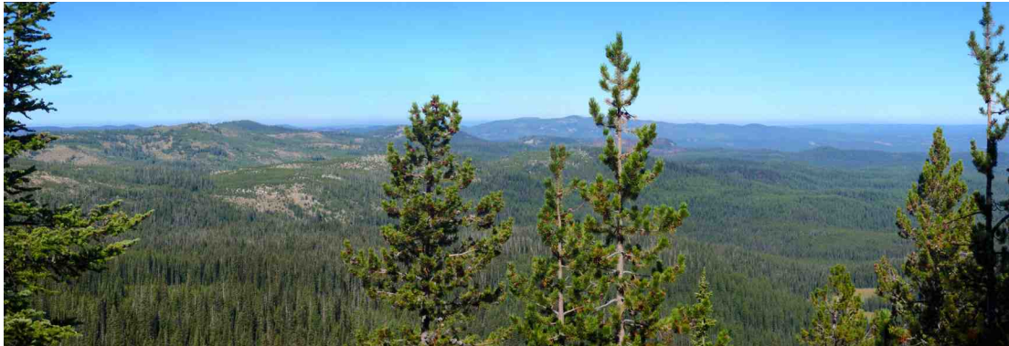
The La Grande Watershed (at right) is an unroaded, unlogged and ungrazed part of the north Elkhorns.