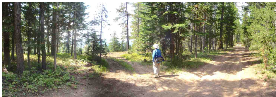
For the first mile, the route follows Road 250 along the ridge top, through mixed lodgepole and fir.