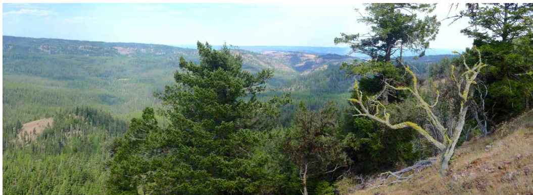
To the north are wide views down the Beaver Creek watershed toward the Grande Ronde River.