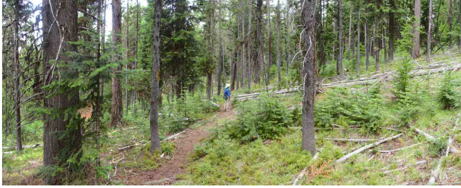
The trail to the rim passes through alternating sections of thick, unlogged white fir...