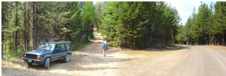
The hike starts on high-clearance Road 250, at its intersection with main Forest Road 43.