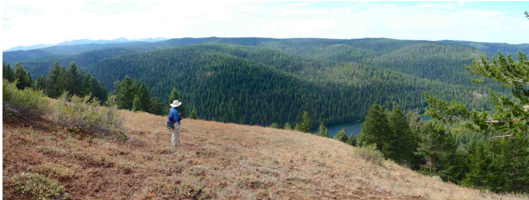
At 3.1 miles, one arrives at the rim top, with views west over the reservoir and south to the high Elkhorns.