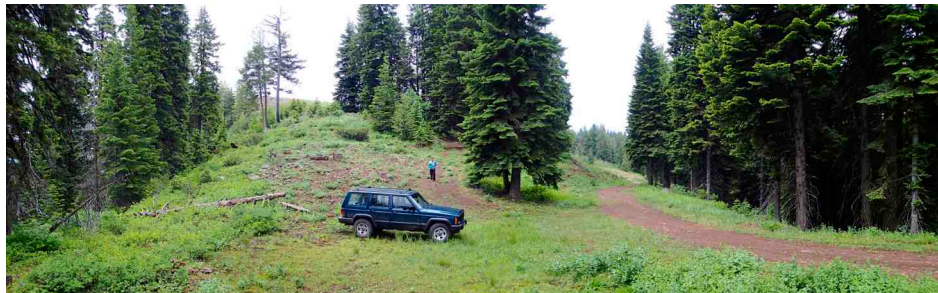
The hike to the rim starts on an unsigned dirt jeep road branching southeast off Road 110.