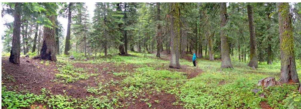
At times, the route passes through stands of big old-growth fir, just back from the rim's edge.