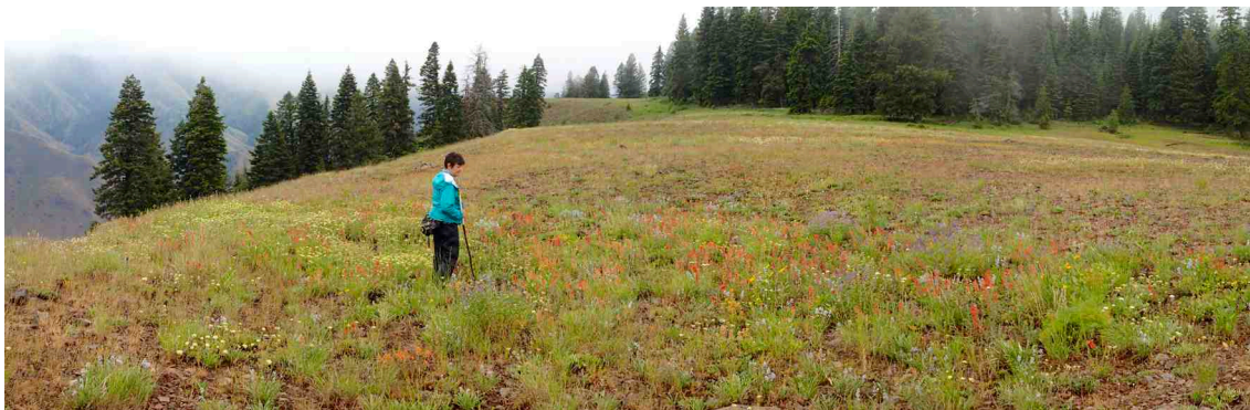
The best hiking route is south cross-country, along the edge of the trees — through wildflowers in Spring.