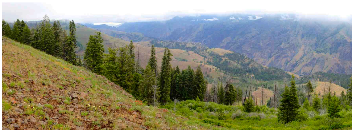
The first views from the rim are over bench lands within Hells Canyon to the Seven Devils range beyond.