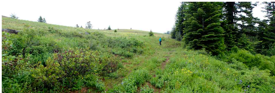
One can follow this jeep road for a half mile to the rim, or just strike off cross-country to reach the top.