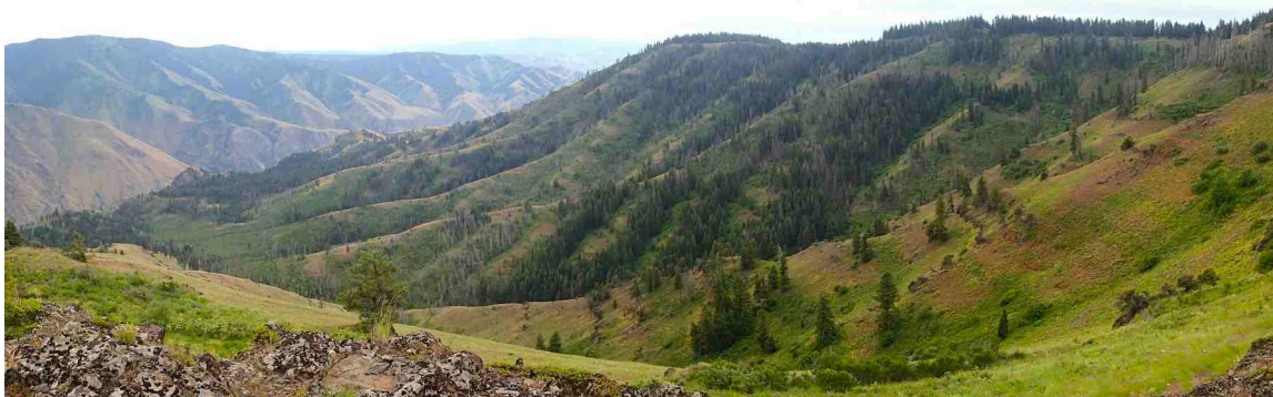
The level rim of the McGraw Divide (at center) offers relatively easy hiking access to upper Hells Canyon.