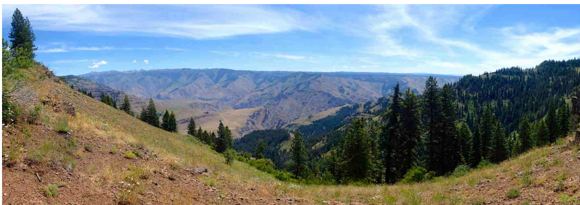
Near the end of the rim, on a clear day, are more sweeping vistas east over the Hells Canyon gorge.