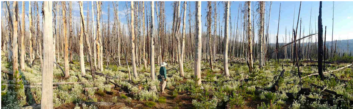
Climbing above the bluffs, the trail passes through a "ghost forest," left from the 1995 Twin Lakes Burn.