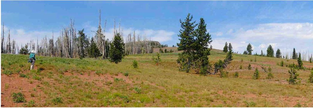
Climbing cross-country up the southeast ridge, the easiest route is to the right of the fire-killed trees.