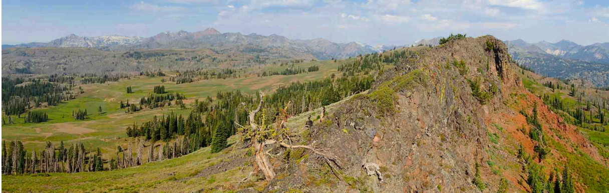
At the summit of Sugarloaf Mountain, one has panoramic vistas west to Granite and Red Mountains...