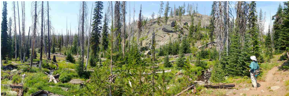
For the next mile, the trail ascends Lake Fork Creek, past granite ridges and wet wildflower meadows.