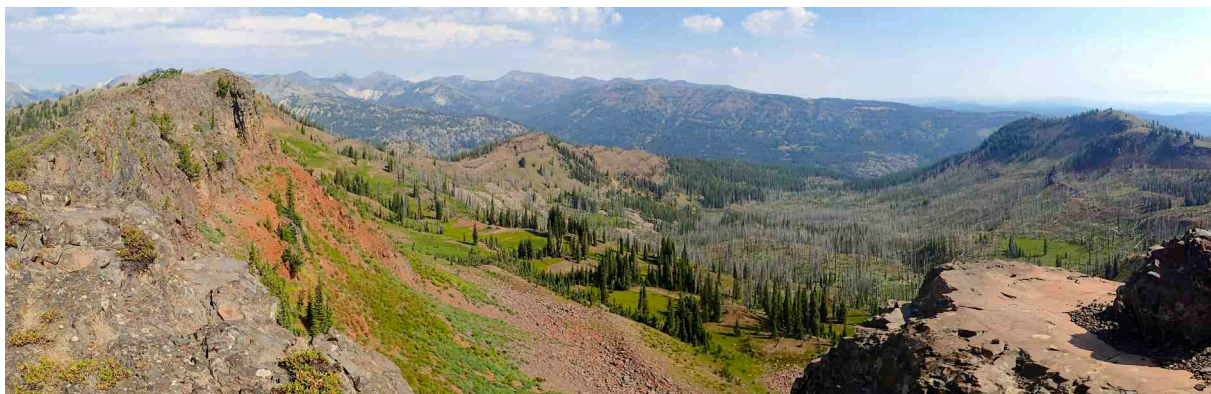
...and views north to the High Wallows, Aneroid Mountain and the long Imnaha Divide (right center).