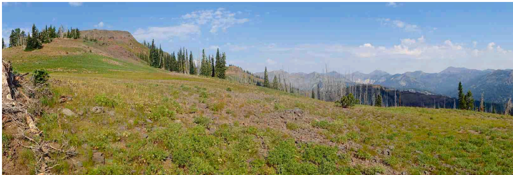
Approaching treeline at 3.0 miles, the first views are north to the headwater peaks of the Imnaha River.