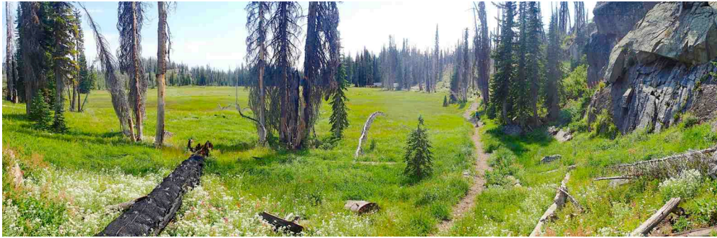
Leaving the Deadman Trailhead (center), the trail skirts a wet meadow, beneath sheer granite bluffs.