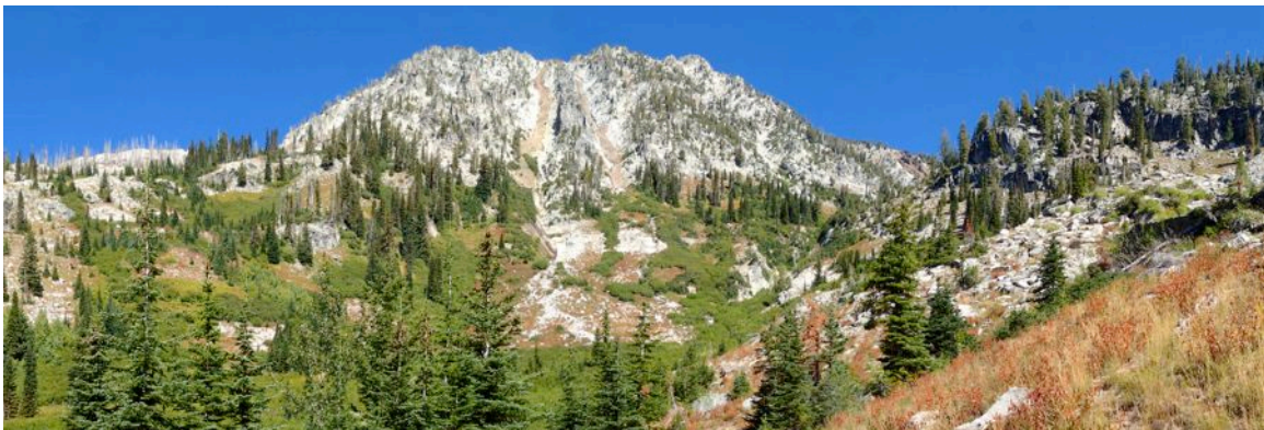
Following old trails further up West Eagle Creek, one can find more spectacular vistas and waterfalls.