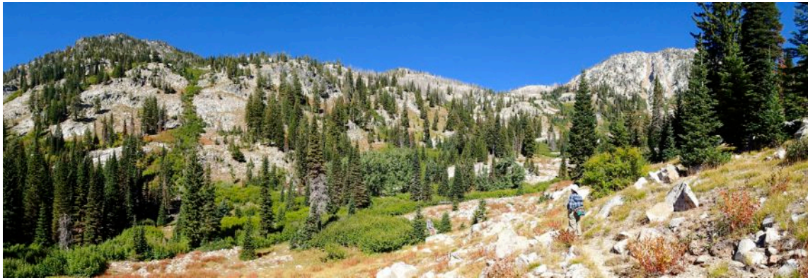
Past the turnoff to Echo Lake, the trail enters a wonderfully scenic, alpine valley that is seldom-visited.