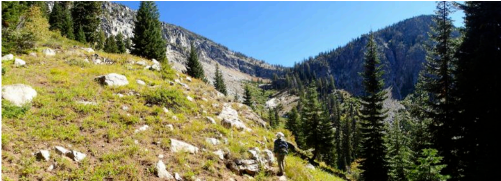
On switchbacks above the ford are views of the hanging valley and waterfall of East Fork West Eagle.