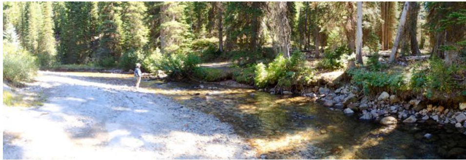
At 1.2 miles, the trail fords West Eagle Creek — knee-deep in July and ankle-deep in September.