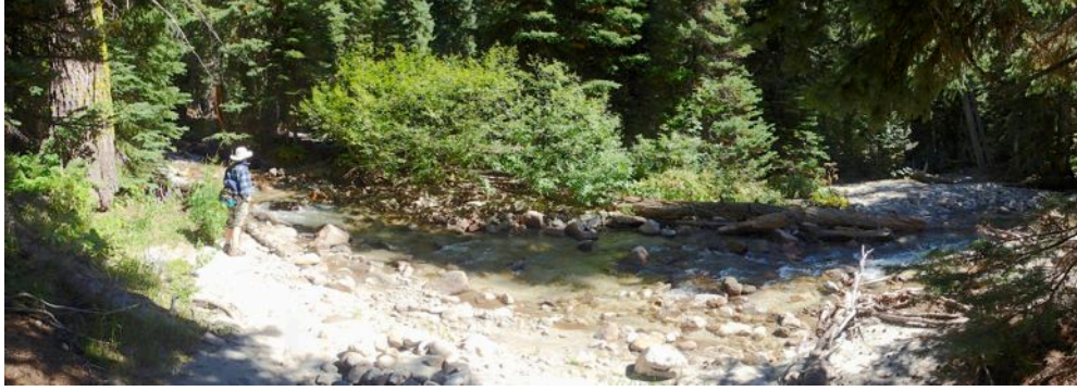
At 2.6 miles, the trail makes a second ford of West Eagle Creek — and crossing logs are hard to find.