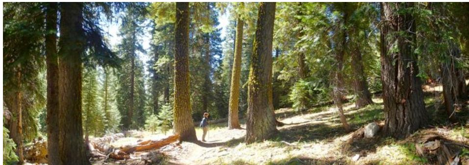
Past the creek ford, the trail climbs gradually through stands of enormous, old-growth grand fir trees.