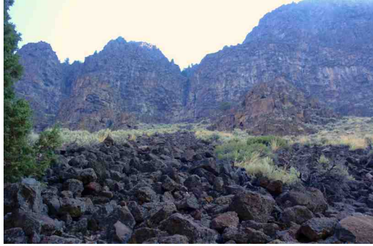
The vertical cliffs and fallen rock fields are a remarkable sight...