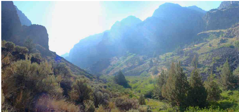
Once the unstable rocks exceed your comfort level, find a spot along the creek for a rest and snack...