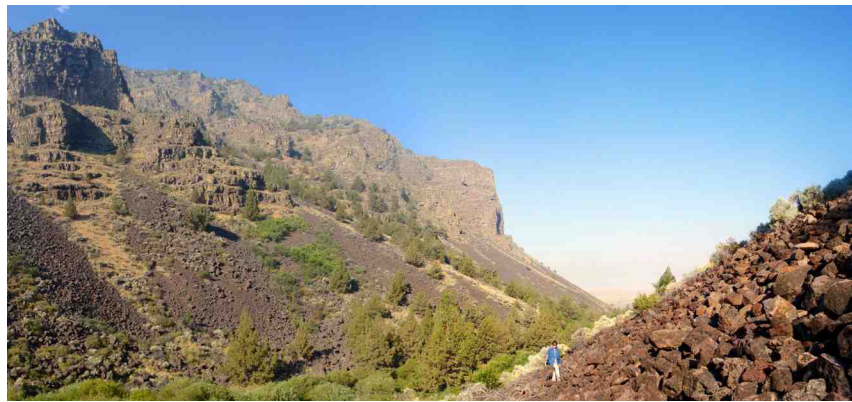
...but further up the canyon, the rock fields eventually become too steep and unstable for safe travel.