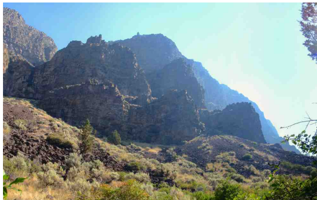
...and enjoy the fantastic rock spires and cliffs overhead. Keep an eye out for bighorn sheep.