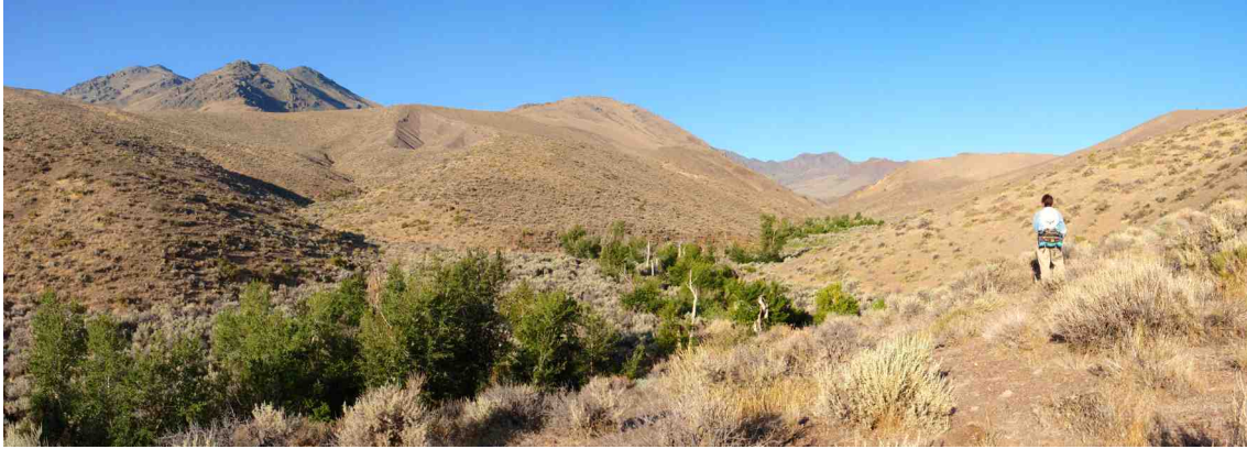
The middle canyon is easy hiking on game trails, skirting just above the sagebrush flats along the creek...