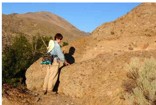
Hiking over steep and loosely-consolidated beds of old river deposits requires caution at one point.