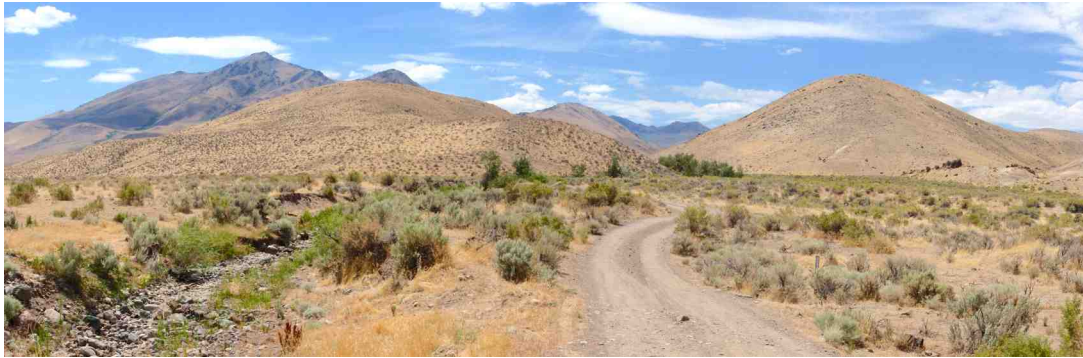
From the highway, Little Cottonwood Creek is mostly hidden within the folds of the Pueblo Mountains.