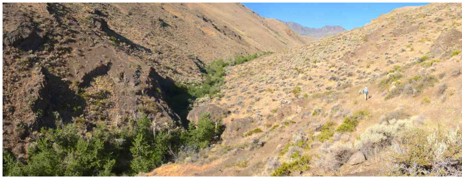
When it's running, the creek cascades over this dark rock outcrop in a small waterfall.