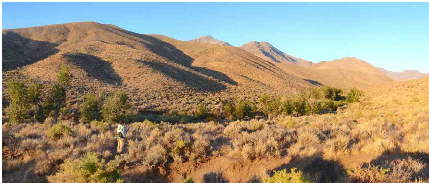
For the first mile, the route follows a faint, double-track jeep trail on the north side of the creek.