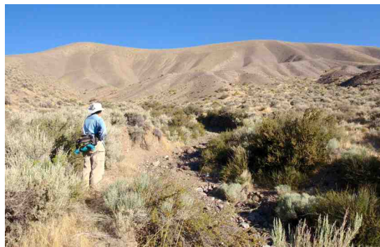
...but there are several deep, dry tributary washes to cross over.