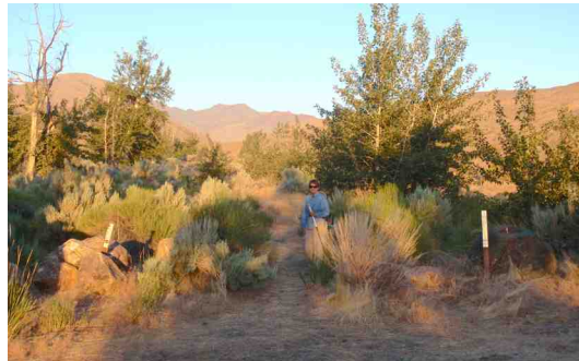
The hike starts at the “Wilderness Study Area” markers at the end of the access road.