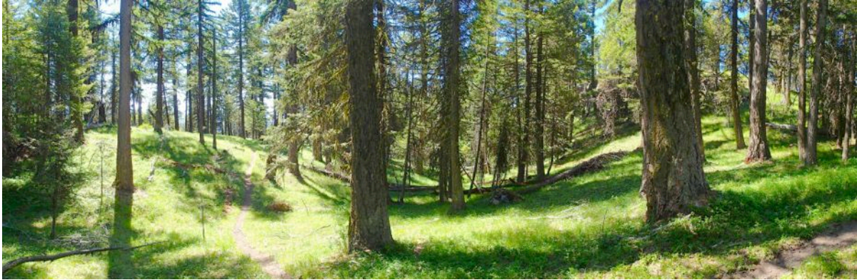
Once top of the ridge, the trail winds through stands of old-growth trees, with a grass understory.