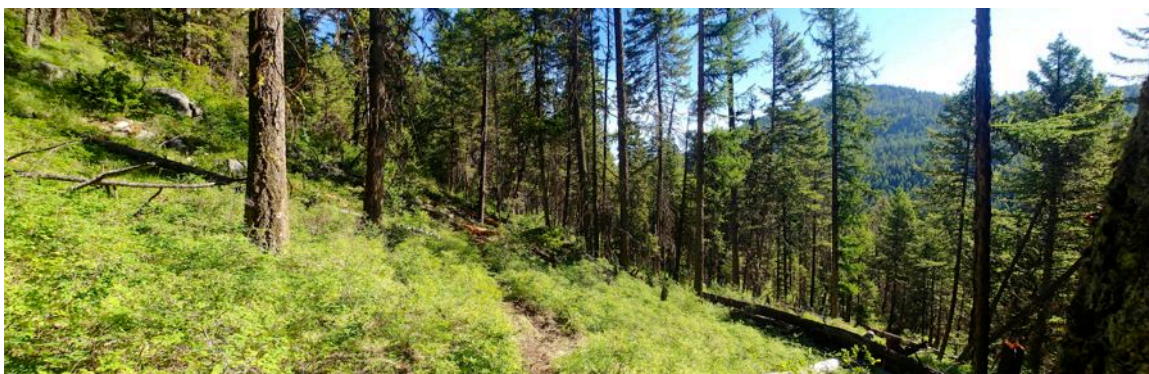
For the next 1.5 miles, the trail climbs through a mixed larch and fir forest, with views of Storm King Mtn.