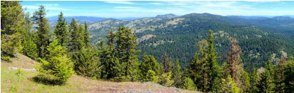
From a bald knob just east of the summit, one has views north to Bodie Mountain (at far center)...