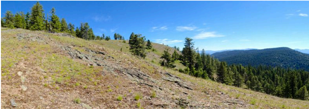
At 2.3 miles, the route leaves the trail and climbs cross-county for a half mile up toward the summit.