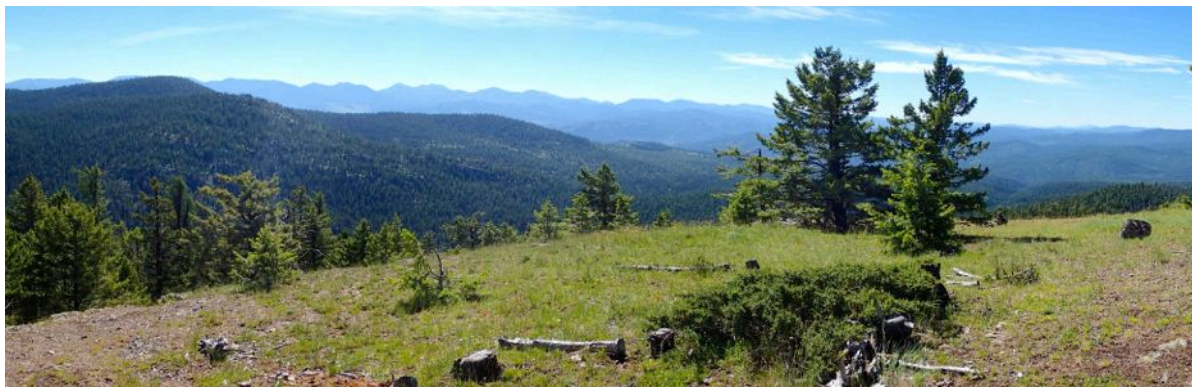
...plus long, panoramic vistas southeast to the crest of the Kettle River Range on the far horizon.