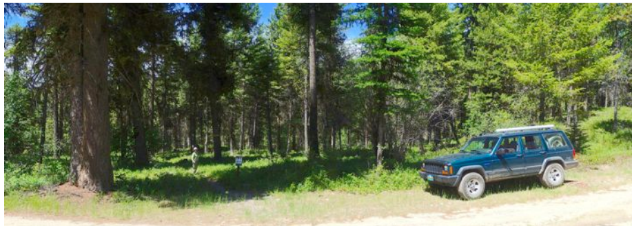
The trailhead is on Road 2086 (aka Sheridan Road), just beyond the cattle guard at the USFS boundary.