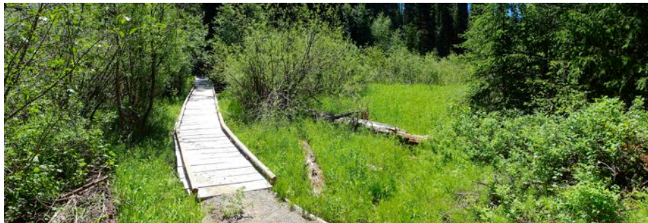
For the first half mile, the trail descends to marshy Granite Creek and crosses on a 50' footbridge.