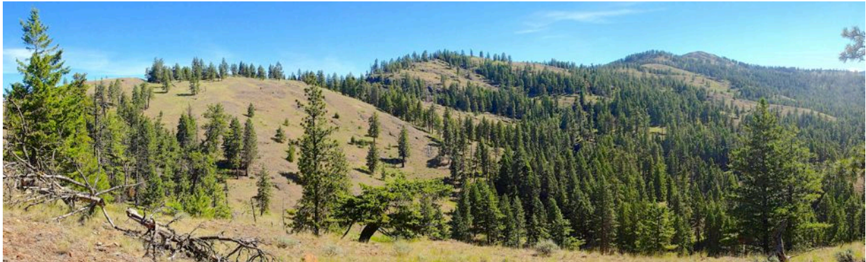
The trail follows a long, sparsely-forested ridge to the 4,885'-high summit of Thirteenmile Mtn. (far right).