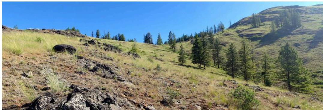
At 2.6 miles, the route leaves the trail and climbs steeply cross-country up the west ridge to the summit.