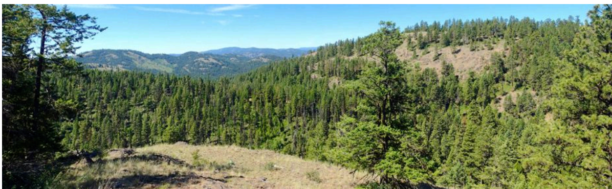
Past the creek, the trail climbs steeply to the ridge crest, with long views south down Thirteenmile Creek.