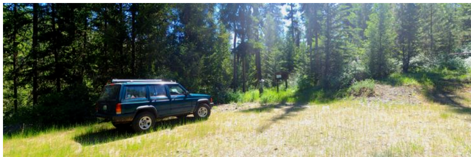
The hike starts at the little-used Cougar Trailhead, in a large gravel parking area off Road 2054.