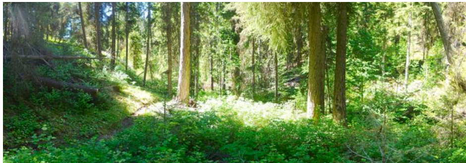
In the first quarter mile, the trail descends into a shady, spring-fed creek, with old-growth larch trees.