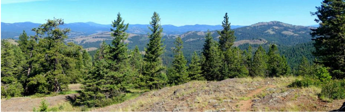
At 2.2 miles, as the trail climbs along the ridge, one has wide vistas north over the Okanogan Highlands.