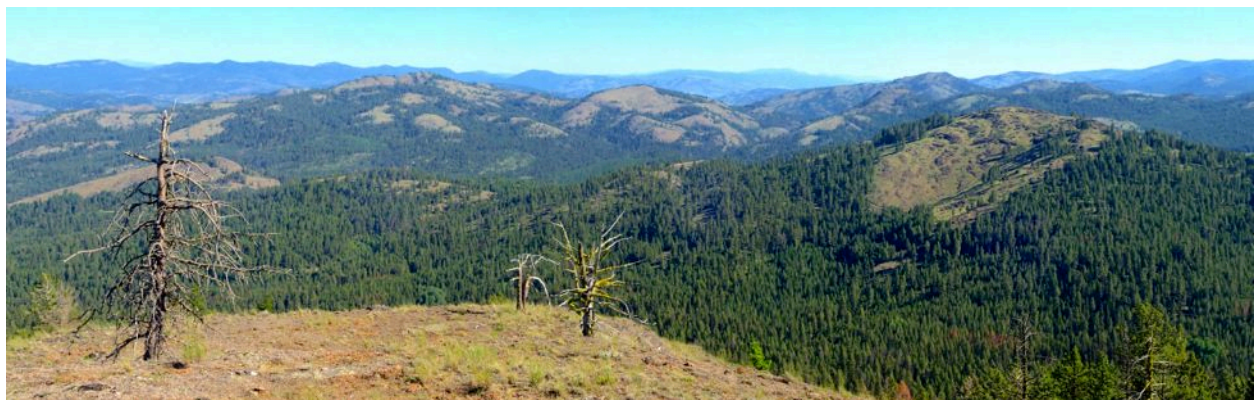
The summit views are big and panoramic, west to the High Cascades and east to the Kettle River Range.