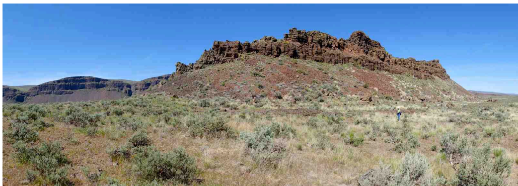
At 0.7 miles, the established trail peters out on the east edge of The Great Blade in East Lenore Coulee.