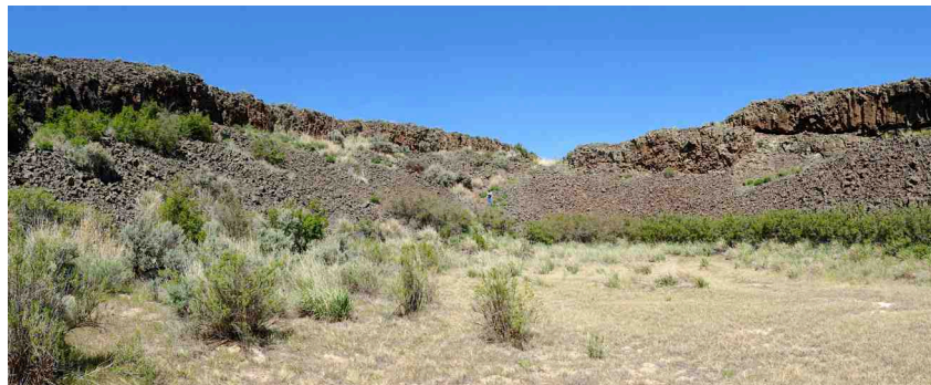
Past the notch, the trail crosses a wide coulee, before climbing up this talus slope at its north end.