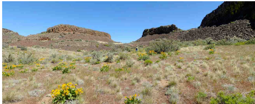
After a short steep climb, the trail crosses a gently sloping bench, heading for the notch at center.