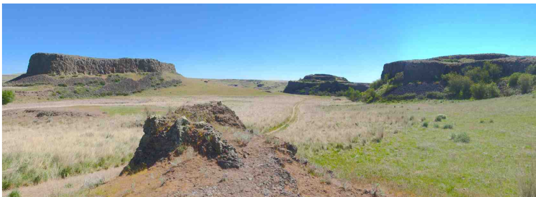
Nearing the ranch buildings, the upland return route rejoins the main road, through dramatic basalt buttes.