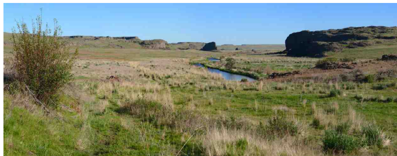
After a mile of winding through picturesque buttes on the uplands, the jeep track meets Rock Creek.