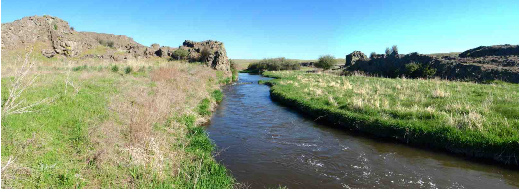
At 3.0 miles, one finds rock outcrops and shade trees — a good destination for an out-and-back hike.