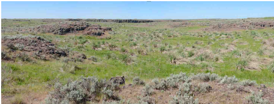
The upland return route features wildflowers, mima mounds and long views of the desert scabland terrain.