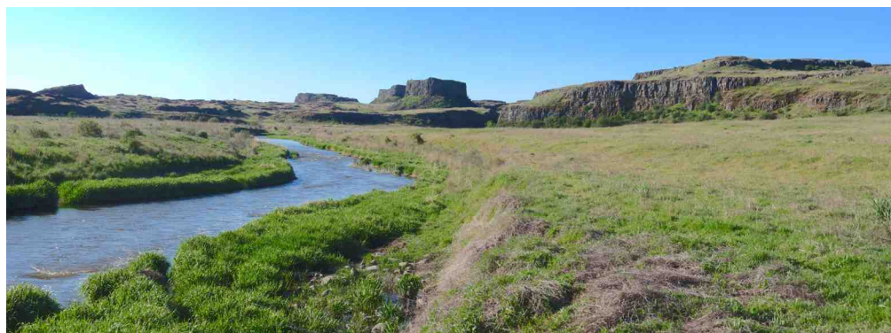
The jeep track continues north along the creek, with nice views back south of the coulee walls.