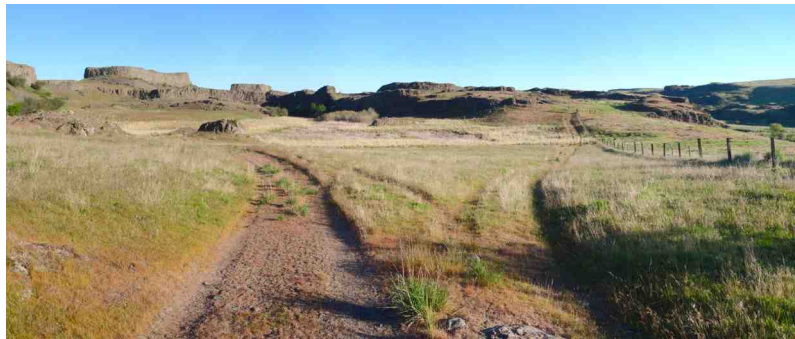
Two hundred yards past the ranch buildings, the route follows a jeep track north off the main road.