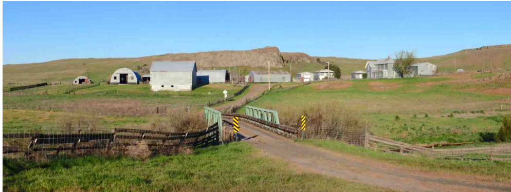
The hike first crosses the Rock Creek bridge and passes through the abandoned Escure Ranch buildings.