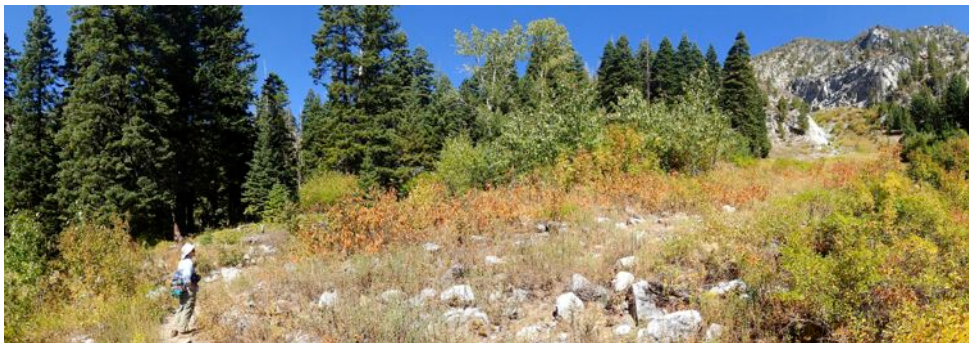
...which are interrupted at intervals by open snow avalanche chutes, such as The Box canyon.