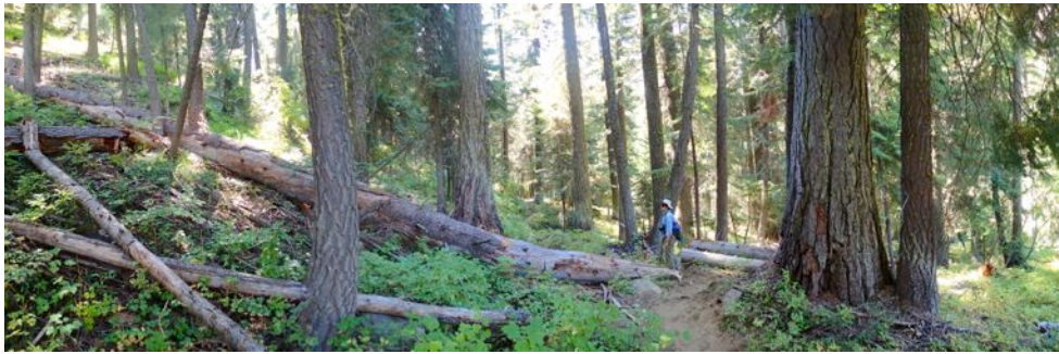
For the first 2 miles, the trail passes through thick, uncut forests of douglas fir and true fir...