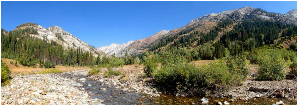
If feeling ambitious, one can explore the scenic upper canyon of East Eagle Creek for several more miles.