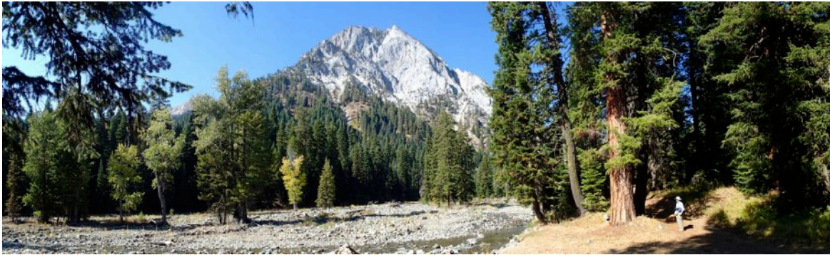
The trail starts on a jeep road along East Eagle Creek, with views of the 2,400-foot face of Granite Cliffs.