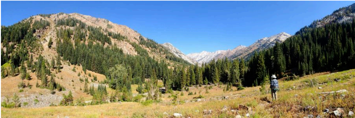
The upper canyon is mostly open, with spectacular views of the glaciated peaks of the High Wallows.