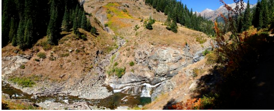
At 2.5 miles, the creek below the trail twists through a corkscrew slot in the rock, with a fantail of spray.