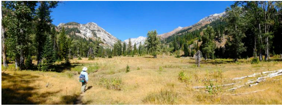
At 4 miles, the trail enters a grassy meadow between Snow and Coon Creeks — a nice lunch destination.