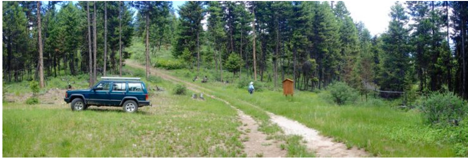
The new, lower trailhead is easily-accessible off Road 3240 and invites a counter-clockwise loop hike.