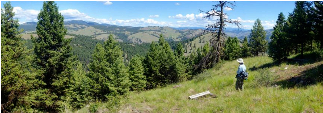
At 2 miles, the trail ascends to an overlook at the end of the ridge, with panoramic vistas north and west.