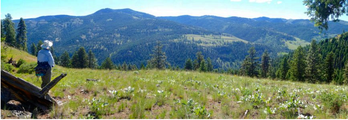
Once the trail leaves the trees, one has wide views east to Bodie Mtn. and the historical mining district.