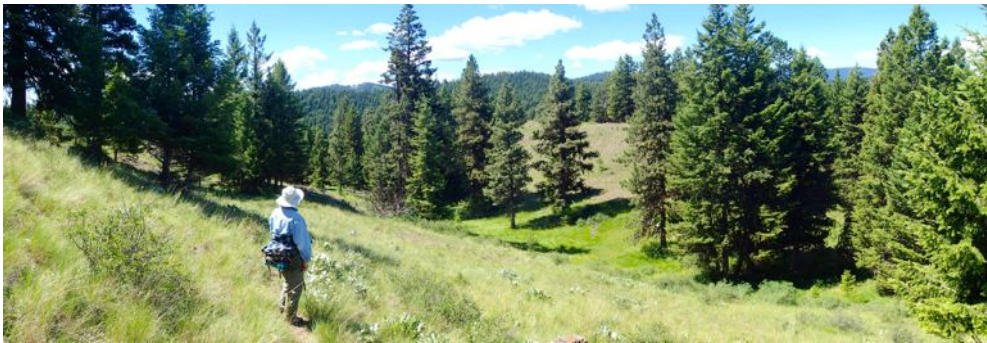
The return loop hike to the trailhead features more views, and more old growth ponderosas and firs...