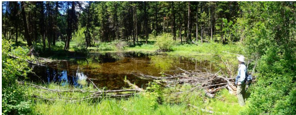
...plus several small ponds and cattail marshes tucked into the forest just next to the trail.