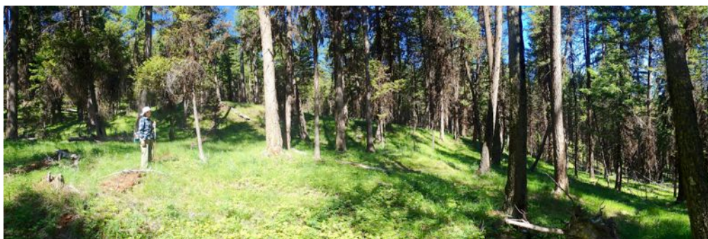
For the next half mile, the trail descends a series of shady benches, through thick douglas fir forests.