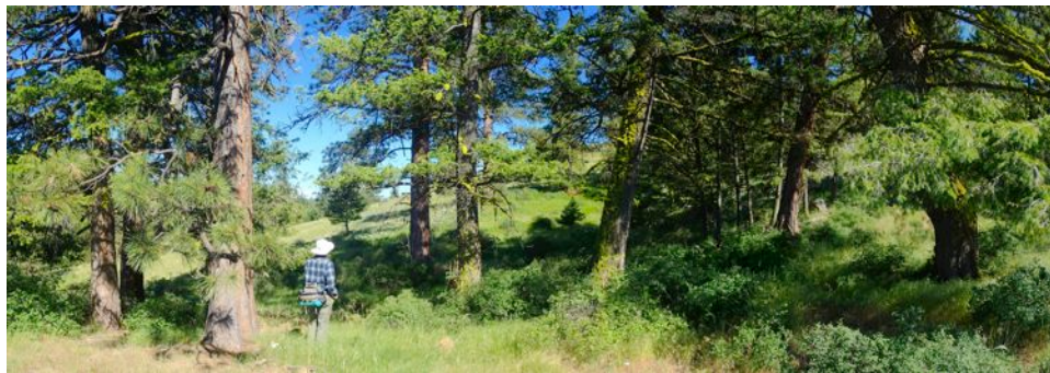
Within one-third mile, the trail crosses grassy slopes to the first old-growth ponderosa and fir trees.